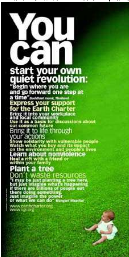
"Earth Charter in Action" (Panel 5)