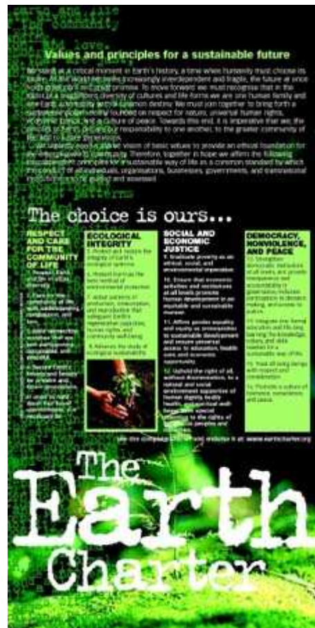
“The Earth Charter as a tool” (Panel 2)