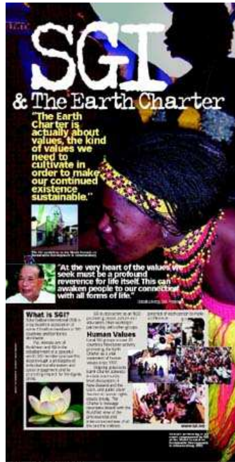
"Earth Charter in Action" (Panel 4)