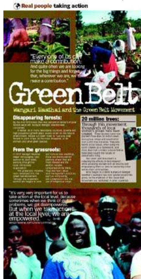
“Real people taking action” (Panel 1)