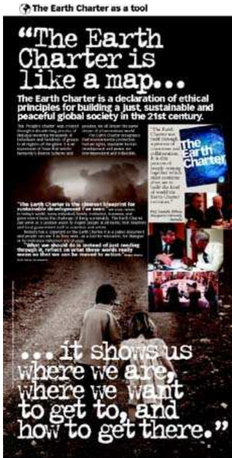
“The Earth Charter as a tool” (Panel 1)