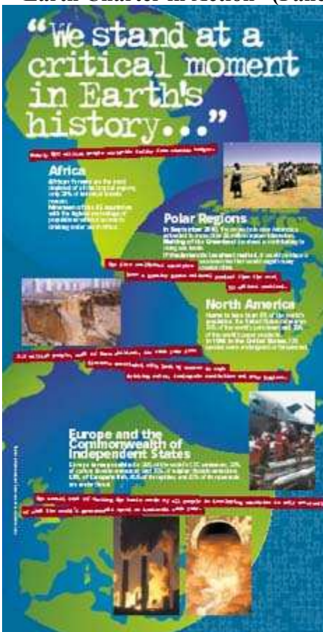
"Earth Charter in Action" (Panel 6)