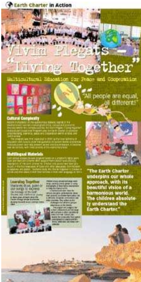
"Earth Charter in Action" (Panel 3)